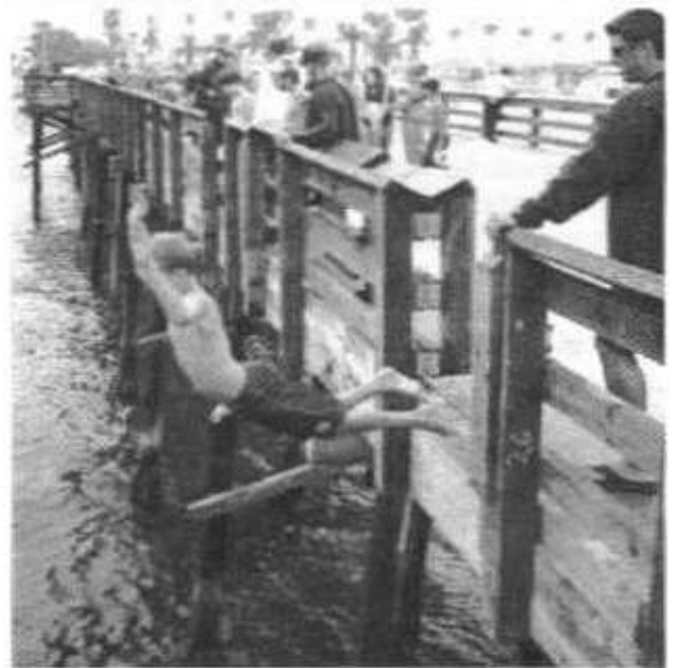
Leaping into Summer – A Newport Beach Junior Lifeguard takes the plunge off of the Balboa Pier. Newport Beach's commitment to making each summer memorable for every one of its 1200 Junior guards is evident in the creative training and competition events that it offers. From mock-rescues to pier jumps and boat orientations, the Jr. Lifeguards get a firsthand look at what it takes to keep over 10 million visitors to Newport Beach safe every year.